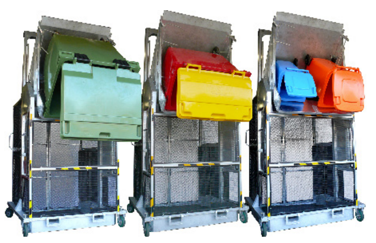
1100 Litre or 660 Litre 4-wheeled skip bins.

One machine - custom lifts to 425 kgs: cradle automatically holds an 1100 or 660 4-wheeled bin, or up to 2 standards wheelie bins ... no manual adjustment